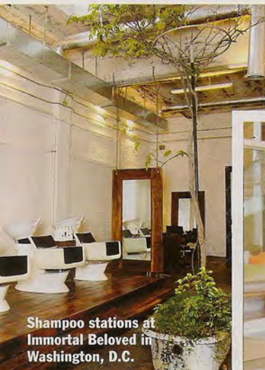
Shampoo stations at Immortal Beloved in Washington, D.C.