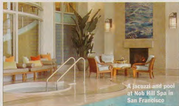
A jacuzzi and pool at Nob Hill Spa in San Francisco