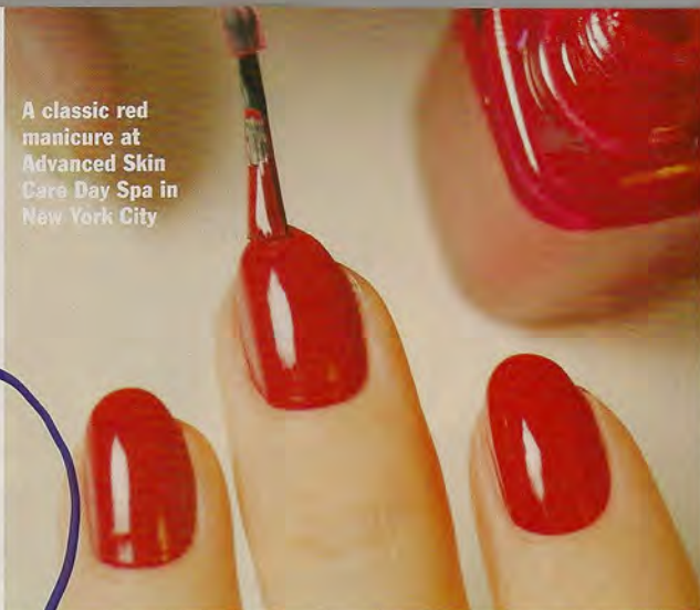
A classic red manicure at Advanced Skin Care Day Spa in New York City

Address: 2340 Polk St. Phone: 415-749-0990.